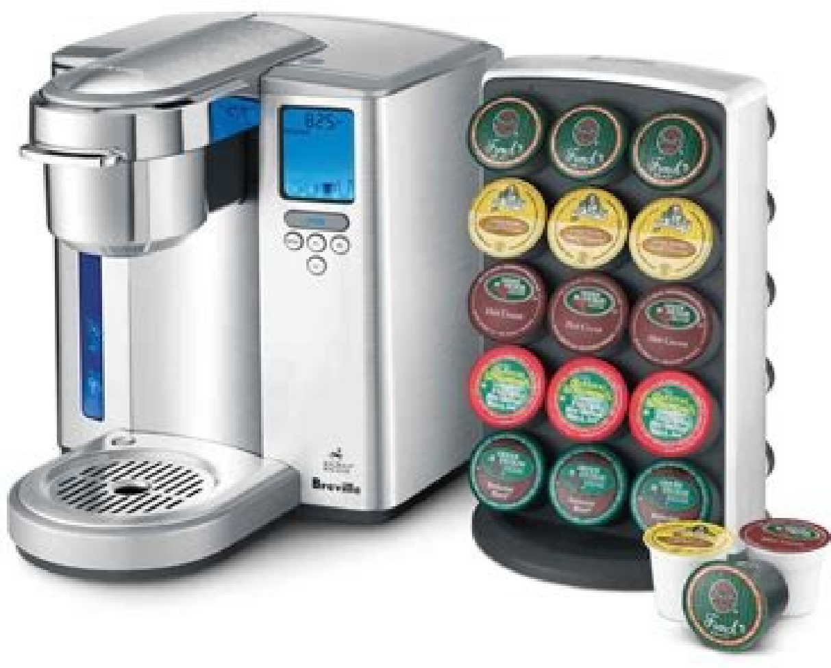
Cleaning cycle for breville espresso machine. Breville barista express clean me instructions. How to clean and descale breville espresso.